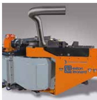
VB 152 HP